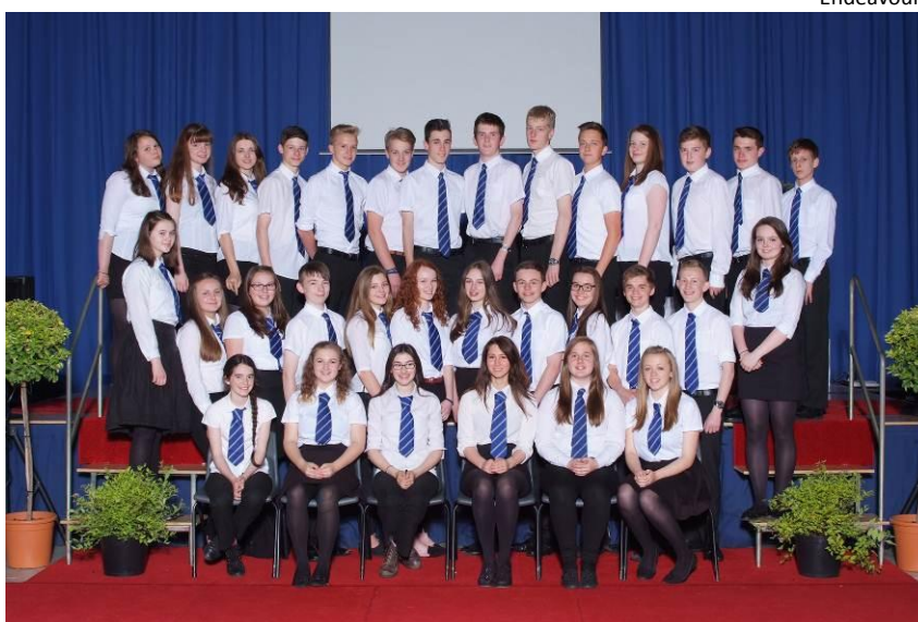
S3 Awards and Prize Winners