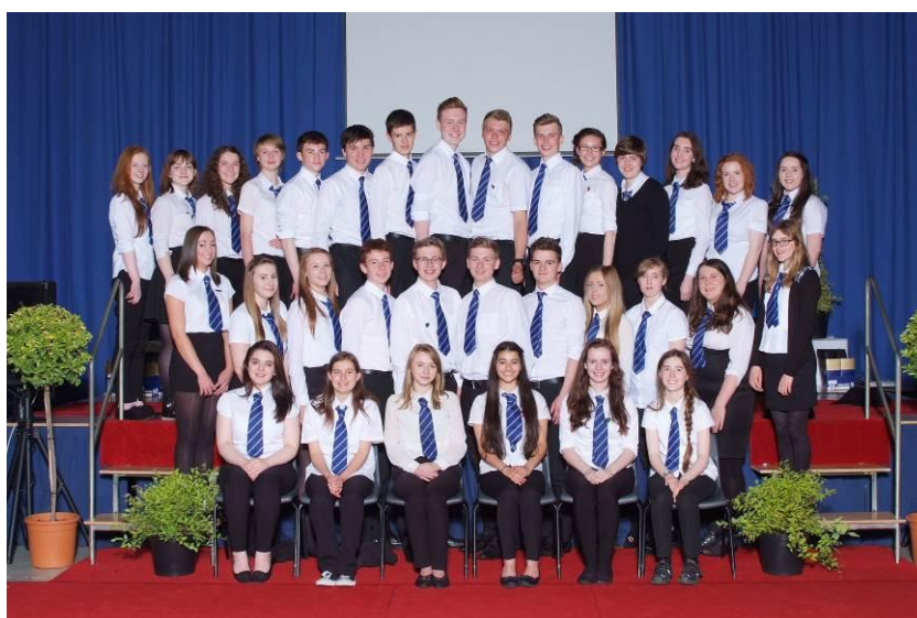
S4 Awards and Prize Winners